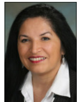
Pro-choice State Senator Claudia Kauffman (47th District). Senator Kauffman is in a tight re-election race.