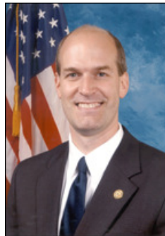
Pro-choice Congressman Rick Larsen (2nd District). He is being challenged by John Koster, a Tea Party, anti-choice conservative.

Two pro-choice Congressional seats are at risk, and pro-choice Suzan DelBene is running a strong race against anti-choice Rep. Dave Reichert in the 8th district. Many of our pro-choice state legislators are in very tight races.