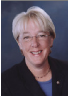
Pro-choice champion Senator Patty Murray

Many of our pro-choice leaders are in races that are too close for comfort.